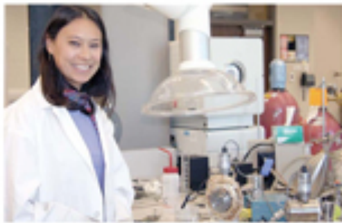
Postdoctoral fellow... (Caption text is partially obscured)

"I have found some real exciting things in the Canadian research program and then there is foreign research that is focused on and interested in what we're doing."