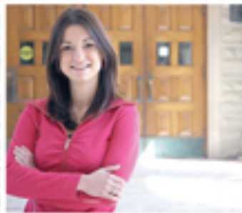
Postdoctoral fellow... (Caption text is partially obscured)

P ostdoctoral fellow... (Main article text continues, partially obscured)