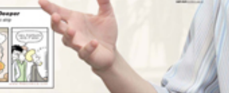
Western News Apr 8, 2010